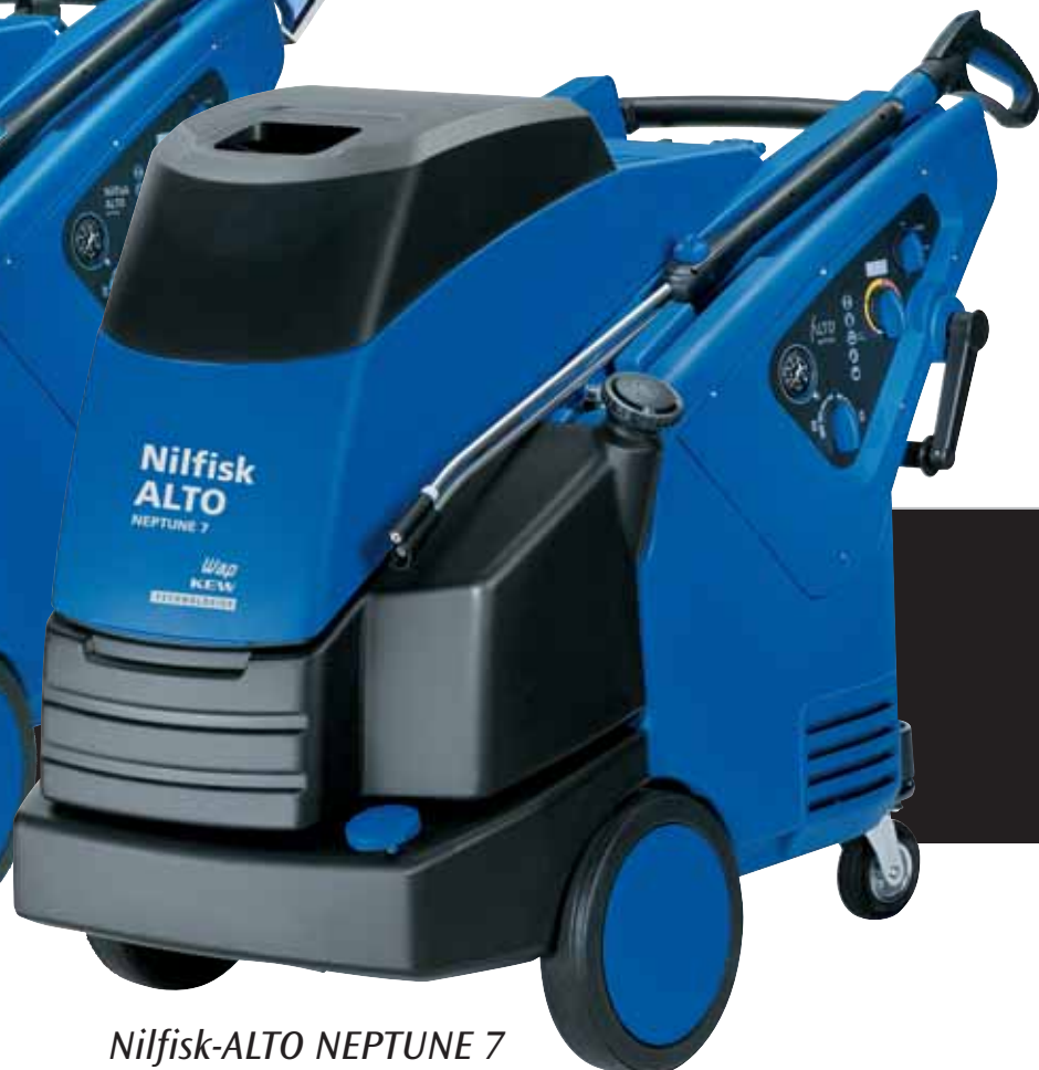
Nilfisk-ALTO NEPTUNE 7